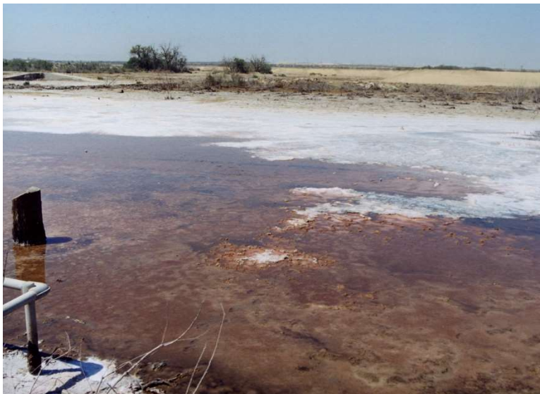
Figure 2. Microbialite and salt crust in the Salton Sea.

The ancient Lake Cahuilla, when full or partially so, became a critical lifeline for migrating birds along the inland path of the Pacific Flyway. Fish and aquatic invertebrates introduced by the flooding Colorado River provided critically important sustenance for wintering, breeding, and migrating geese, ducks, pelicans, storks, herons, egrets, gulls, terns, and shorebirds of many species. These birds and fish provided a cornucopia of food for the indigenous people who lived here. With the conversion of the Colorado Delta to agriculture, the loss of the extensive wetlands as the Colorado River became over-subscribed, and the dry down of Owens Lake to water Los Angeles, the Salton Sea was one of the last refuges for a breathtaking array of bird species.